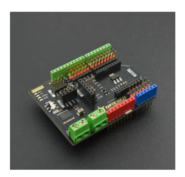
Gravity: IO Expansion & Motor Driver Shield V1.1

Gravity IO Expansion Shield with Motor Driver is a new product designed for Arduino Boards. It combines IO Expansion Shield and DC Motor Driver Shield, equipped with Gravity sensor interface and TB6612FNG dual motor driver. It also has XBee socket, I2C interface and UART port, makes the connections more convenient.