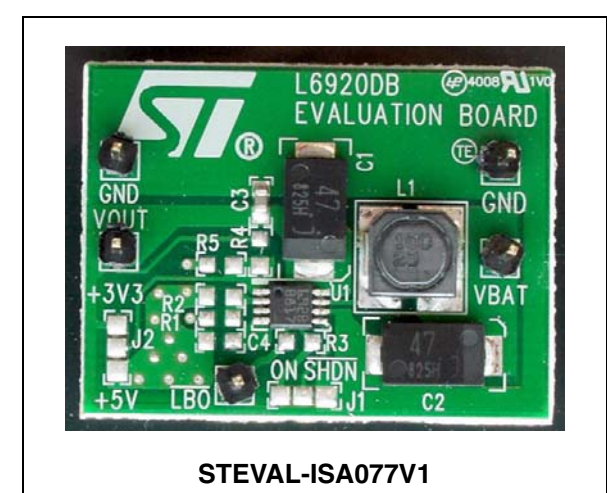
November 2010 Doc ID 18237 Rev 1 1/4

The high switching frequency allows the user to choose small inductors and output capacitors for their designs. Supervisory functions include reference voltage, low battery detection, and shutdown, which are provided with overcurrent protection.