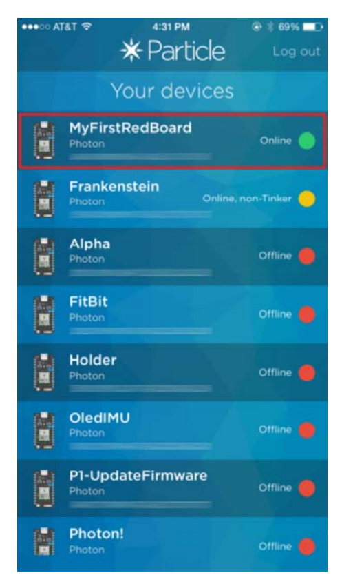
Select a Photon running the Tinker app to tinker with it.

The RedBoard has an LED attached to D7 – perfect for tinkering with. Press "D7", then select digitalWrite to set it as a digital output. It'll initially set itself LOW. To set D7 high, click the pin again. The blue D7 LED should turn on almost instantly!