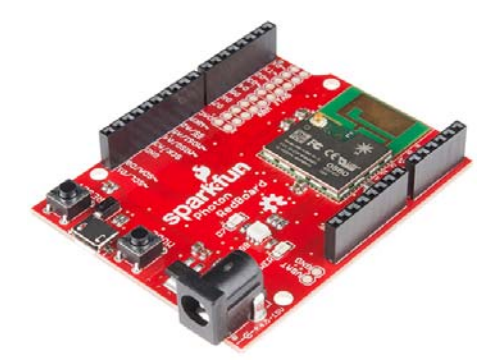
SparkFun Photon RedBoard

The SparkFun Photon RedBoard is an over-the-air-programmable WiFi development board that is compatible with the Particle cloud. At the heart of the Photon RedBoard is Particle's P1 module, which packs an ARM Cortex M3 processor and a Broadcom WiFi controller into a single chip. The I/O, USB, and power connectors are all broken out to a familiar Arduino shape.