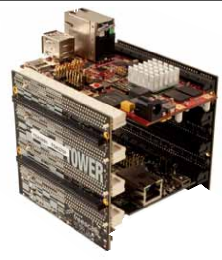
Figure 1. TWR-P1025